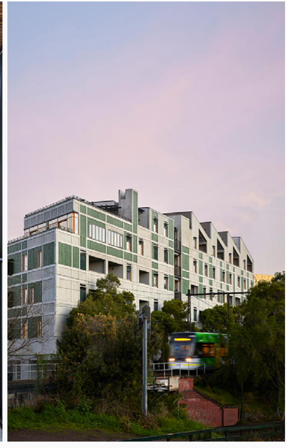
"So much of what we seek to do is make sustainable living easier and more convenient"